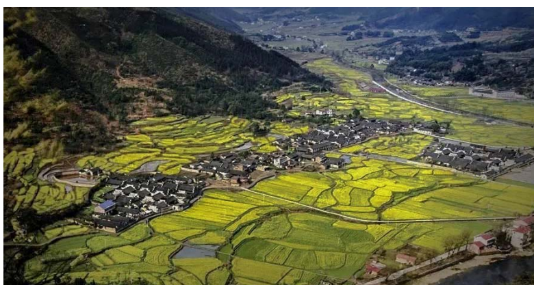
Figure 1. Aerial view of the village from North

The dense forests along the Yellow River in ancient China provided abundant wood resources more accessible than other building materials. In formal terms the structural wooden frame provided great freedom when constructing dwellings and its plan could assume many shapes. In structural terms the main advantage is its resistance to earthquakes, since the elastic quality of the wood and the flexibility of the joints make these structures earthquake resistant; although sometimes masonry walls might fall apart, the wooden frame would usually stay stand [3]. In fact, exclusively the wooden frame supports all the loads of the buildings so the internal walls have mainly enclosure and distribution purposes (besides their contribution to the structure stiffening) which results in a great flexibility in the realization of doors and windows and their material choice. This feature made it possible to adapt the system to the multifarious conditions of the vast Chinese territory according to the local climate.