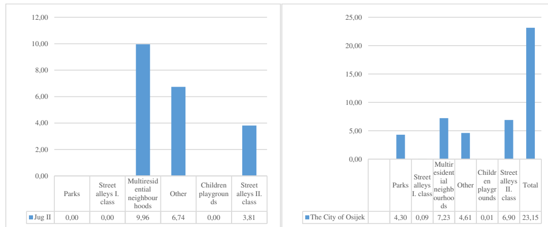
Figure 3. Overview of green area typology per city district, Osijek

According to the population data from the last Population Census in Croatia in 2011, the Down Town district had the highest population density (6,453.54 inh/km 2 ) and household density (2,829.53 no/km 2 ), while the area of the Industrial District had the lowest population density (1,794.07 inh/km 2 ) and the density of households (654.07 no/km 2 ). The district Upper Town that is set up centrally to the city geometry and is predominantly built up area of diverse urban building typology, ranging from low residential density and low buildings to high residential density and high buildings. The Upper City district is also the part of the city where are main public services and business building typology located. Overall low density observed for the area of the Industrial District can be partially explained with large unbuilt part of the south-western part of the city. If data on population density within city districts is linked with the share of green areas it is evident that Upper Town and the area of Fortress district has the largest area covered by green infrastructure while Industrial district that has the smallest green area share (211,960 m 2 ).