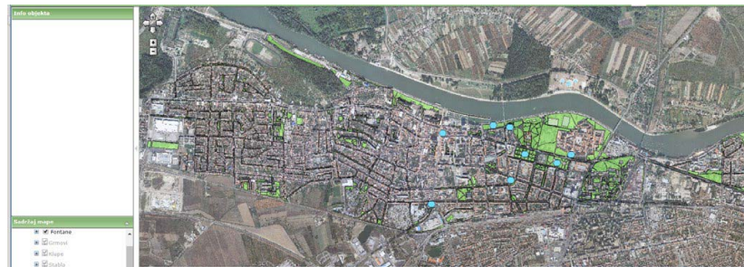
Figure 4. The Green Cadastre of Osijek (GIS tool)