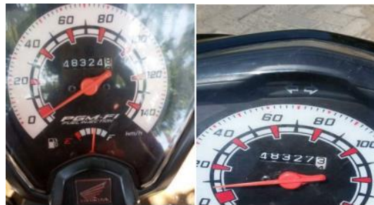
Figure 4. The odometer distance is at the start and end conditions.

Speed data retrieval on GPS cannot be stable due to the influence on the signal so that it affects the transmission of speed data that appears on the monitor screen. So what is done is to calculate the mileage from a bicycle, for example, the data above using GPS in table 5 shows the initial distance is 10,310 km, and the final distance is 12,868 km. Thus the distance is 2,558 km. While on the odometer shows the number of starting bicycle runs is 48324.8 km and ends at a distance of 48327.3 km. It is seen that the odometer shows the bike mileage of 2.5 km. Then the percentage of error reading between GPS and odometer can be calculated by using the equation below,