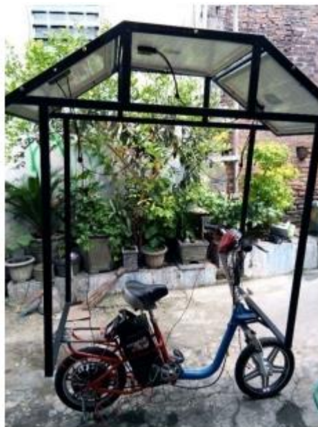
Figure 1. Electric bicycle with three solar panels.