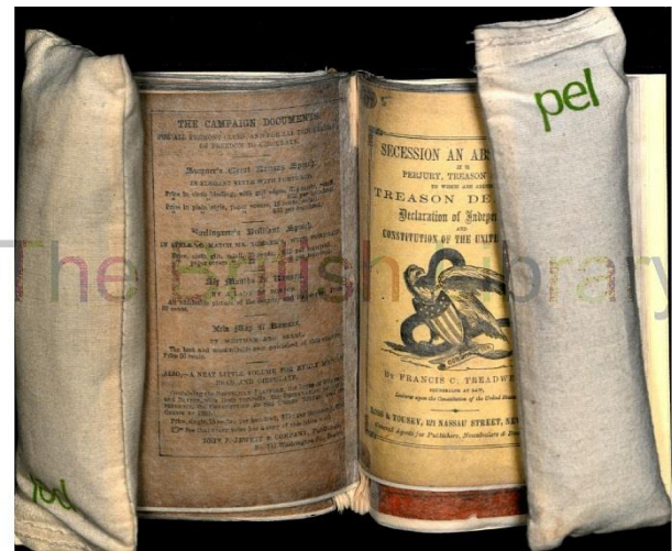
Figure 1. Image of Republican Campaign Edition for the Million , bound with other pamphlets, British Library.

Composed of 72 pages, the 36mo pamphlet, sewn in wrappers, is arranged cleanly into two sections, the first of which includes the Republican platform, biographical sketches of Republican presidential and vice-presidential candidates John Fremont and William Dayton, and features continuous pagination (comprising the first 36 pages). The second section, beginning with its own full title page, is numbered separately, comprising the Declaration and the Constitution and concluding with