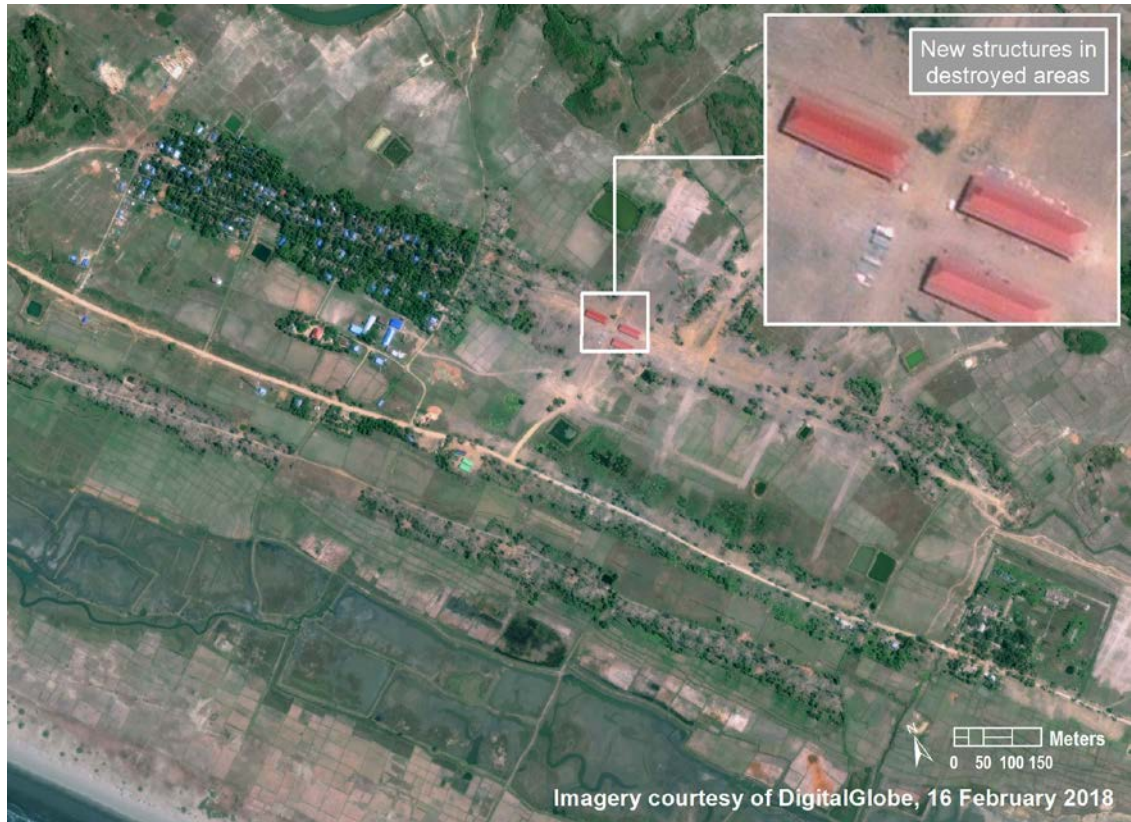
Image 1: Inn Din - Report of the independent international fact-finding mission on Myanmar. (OHCHR, 2018)

Image 2 depicts the exact location of the mass grave in relation to the Inn Din clearance operation. As previously mentioned, this incident offers insight into the actual functioning of the local Tatmadaw. While Burma may appear from the outside to be well on its way to democratization, at the ground level things still remain much the same as they were under the SLORC/SPDC regime.