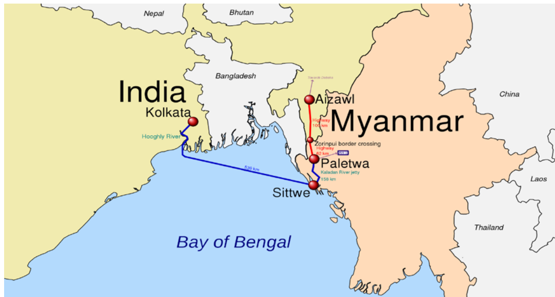
Figure 1: Map of Kaladan Project route.