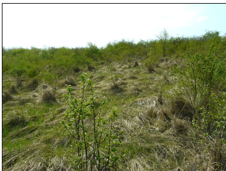
Figure 2. The habitat in which the adder was found, near Săsenii pe Vale, Buzău County (photo by T. Sos).