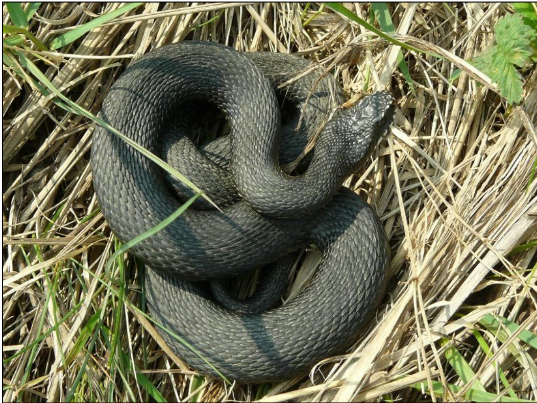
Figure 3. Adult live melanistic female adder ( V. berus) from Săsenii pe Vale, Buzău County.