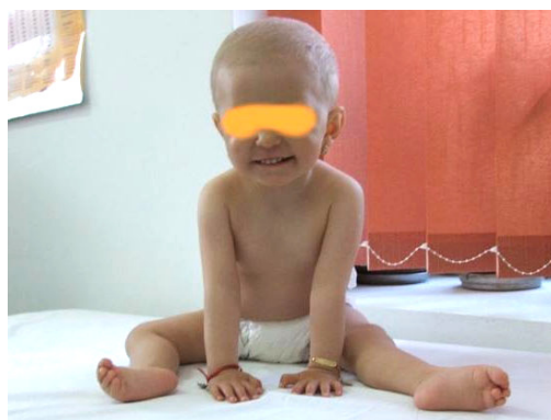
Figure 4. Independent sitting after rehabilitation program

Paraclinical exams revealed: stomach in right hypochondriac region, antropiloric region and duodenum to the left, small intestine placed in the left side of abdomen, colon mostly to the right lumbar region and transverse colon in upper abdomen, intestinal malrotation. Head MRI was normal. EMG (electromyography) - in lower extremities is negative for a neurological lesion, suspicion of miogenic lesion. Cytogenetic analysis performed in Spain revealed an