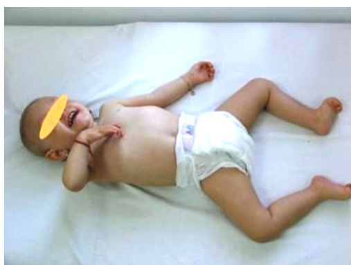
Figure 2. General aspect with frog-leg position of the lower extremities