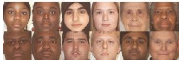
Fig. 4. Some cropped and re-sized images, after face detection, from PAL database

The PAL Database consists of frontal pictures of 576 individuals. The right profile and some facial expressions are also available for some subjects. There are 219 male and 357 female subjects divided into four groups depending on their age: 18-29, 30-49, 50-69 and 70-93 (see Fig. 4). All the faces are frontal and there are no occlusions.