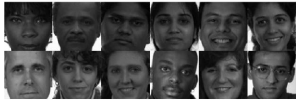
Fig. 3. Some cropped and re-sized images, after face detection, from Color FERET database gallery fa

the detector missed one face, we use 402 female images.