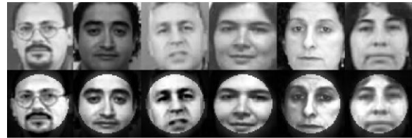
Fig. 1. The first row displays raw cropped face images using the face detector. The second shows equalized and masked images

We have chosen the simple, but yet effective, CC-PPCA procedure to make gender classification on a single face image. As the input for our gender recognition algorithm we crop the images to 25 \times 25 pixels by using a state-of-the-art face detector [Viola and Jones, 2004] (we simply re-size to 25 \times 25 the image region marked by the detector as a face). Additionally, we apply simple histogram equalization in order to gain some independence to illumination changes and then we apply an oval mask in order to avoid background (see Fig. 1).