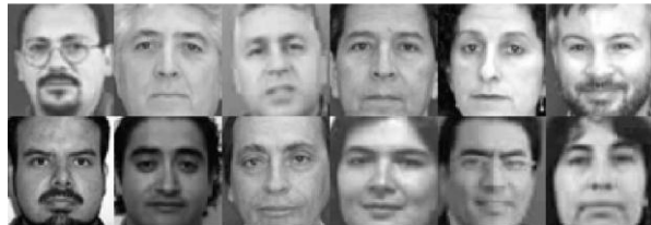
Fig. 2. Some cropped and re-sized images, after face detection, from the Chile Database

The UCN-DataBase is a non-public database consisting on images of people from UCN (including students and lecturers). This data base is built with mug-shot images (one per individual), with different quality ranging from web-cam to digital still cameras used as imaging devices (see Fig. 2 for some sample images). All the faces are facing frontal to the camera with no occlusions. There are images from 10,700 individuals, from which 5646 are male and 5054 female. We used 5628 male and 5041 female images as the face detector missed some faces when preparing the data.