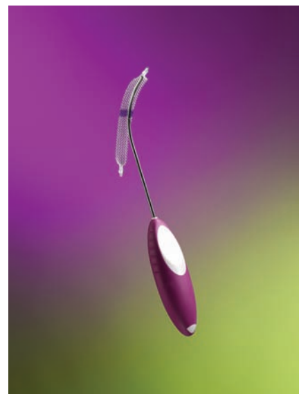
Figure 4. MiniArc ™ Single-Incision Sling.

Effectiveness of (unstabilized) minislings, however, shows a very significant decrement over full-length slings, with early efficacy of the TVT SECUR reported as low as 60%. 17