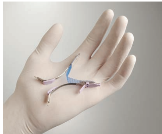
Figure 3. Gynecare TVT SECUR ® (Ethicon Women's Health & Urology, Somerville, NJ).

end. They require local analgesia and a single vaginal incision. They are inserted with a short needle introducer.