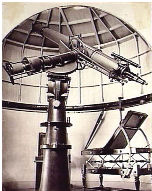
Figure 3. Transit telescope used by Greayer at Adelaide Observatory, pictured with Richard Griffiths.