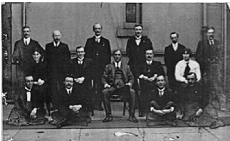
Figure 5. Staff at Melbourne Observatory, c.1914. Peel is middle row, far right.

‘It was the result of much more subtle perceptions of women scientists’ strengths and weaknesses, and of the weight of experience as horizontal and vertical segregation became more entrenched’