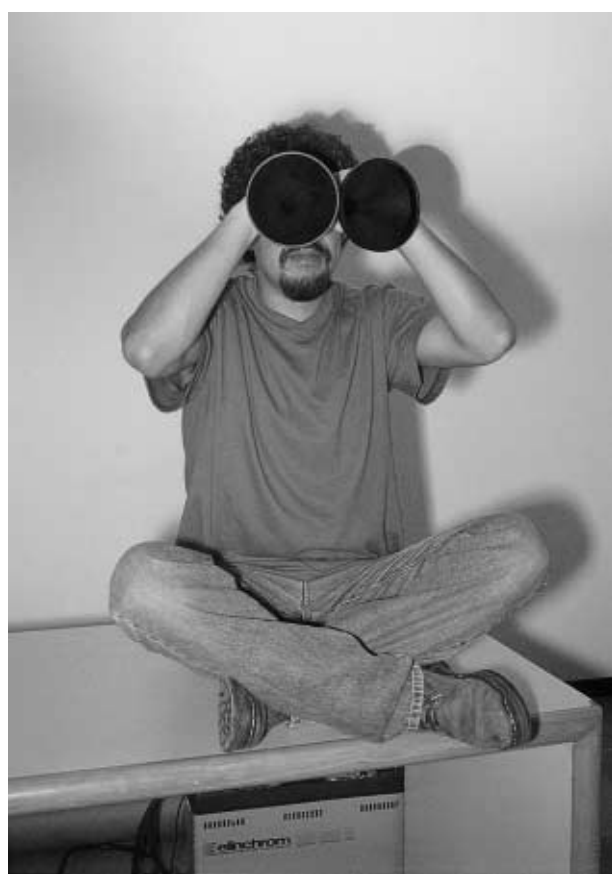
Figure 6 (see text)