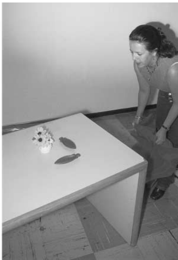
Figure 7 (see text)

cardboard, can be placed amongst the candles to make this point even clearer (Figure 5).