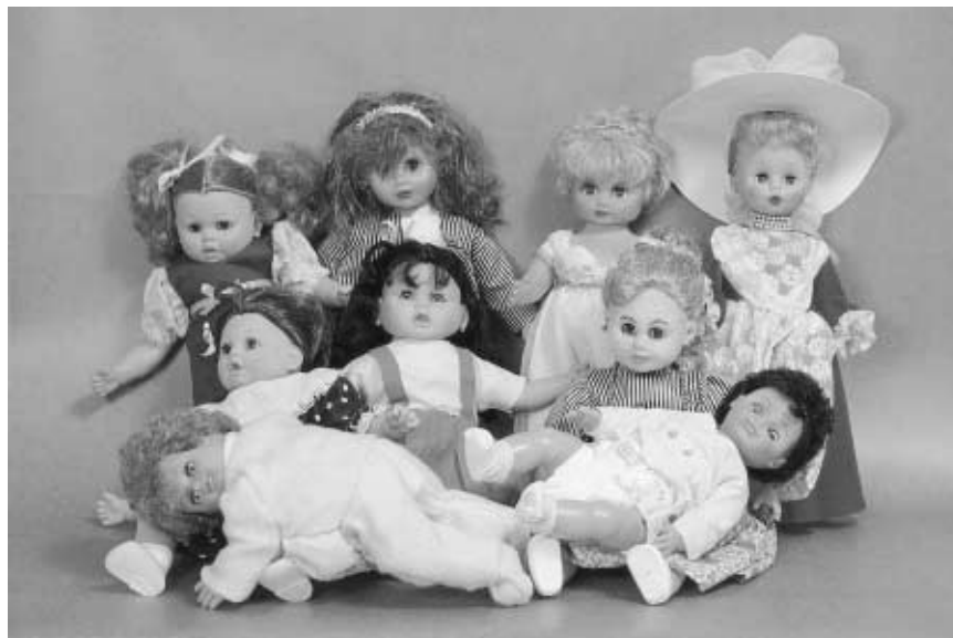
Figure 2 (see text)