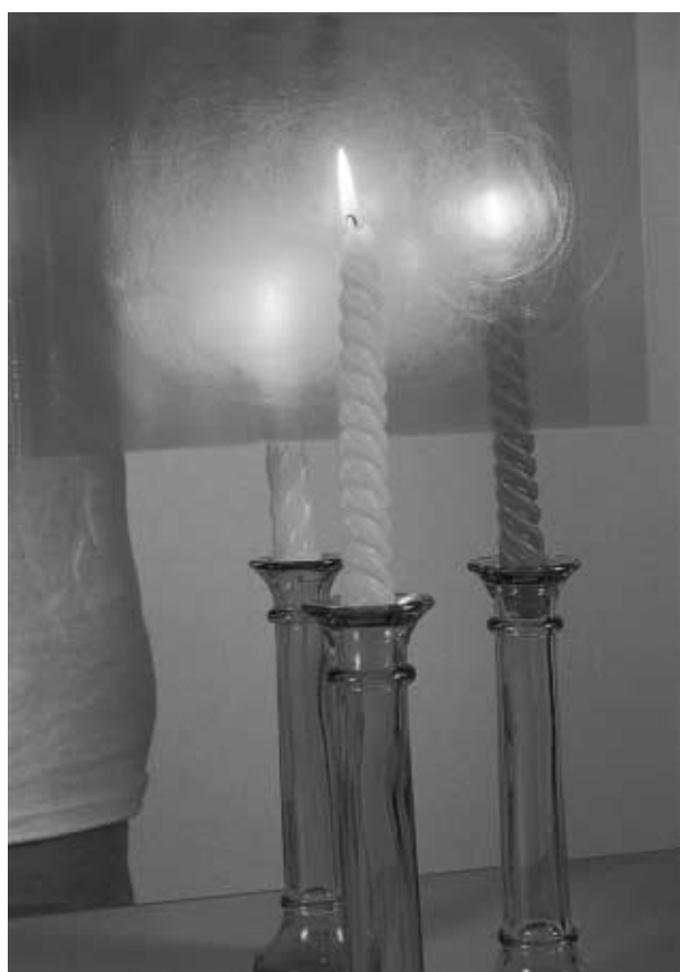
Figure 5 (see text)