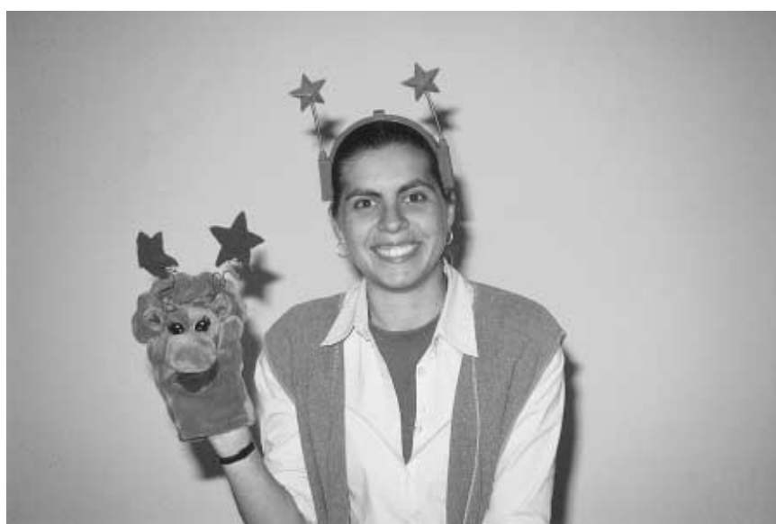
Figure 3 (see text)

ball with successively larger ones, the outcome being that he has to move the point at which he places the centre of the loop towards the heavier ball. He should also use the large light ball to show that the location of the centre of mass does not depend on the volume but on the mass. Using a very heavy and a very light ball will help pupils understand why sometimes the centre of mass lies inside the more massive object.