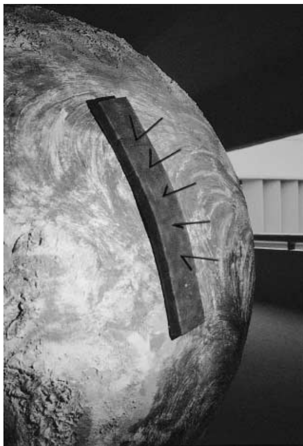
Figure 1 (see text)

When one lectures on the properties of the solar system, one is tempted to present a table. To pupils this makes no sense—they do not realise that by studying a table, similarities and differences pop out immediately.