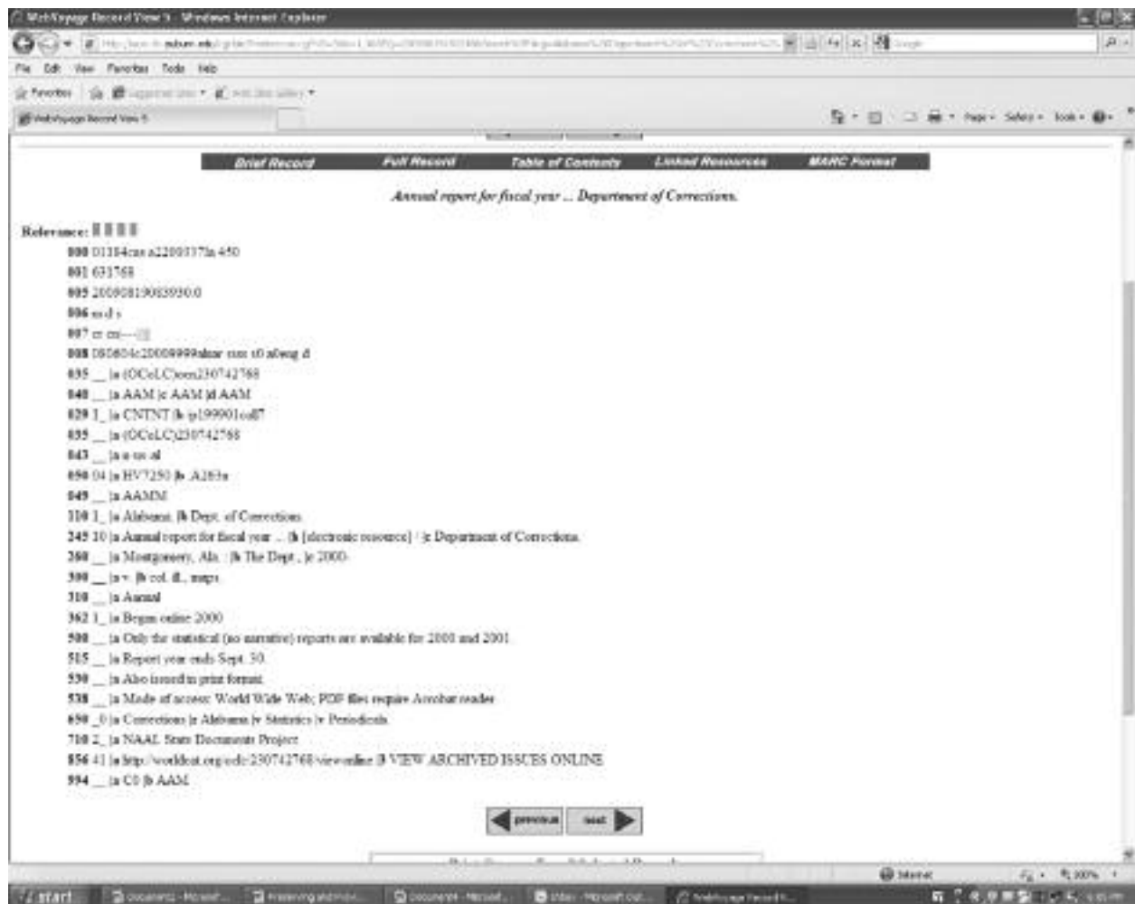
Image 2 Metadata in MARC Format AUM OPAC

Image 2 includes the metadata converted into MARC format as it appears in the bibliographic record in the Voyager OPAC.