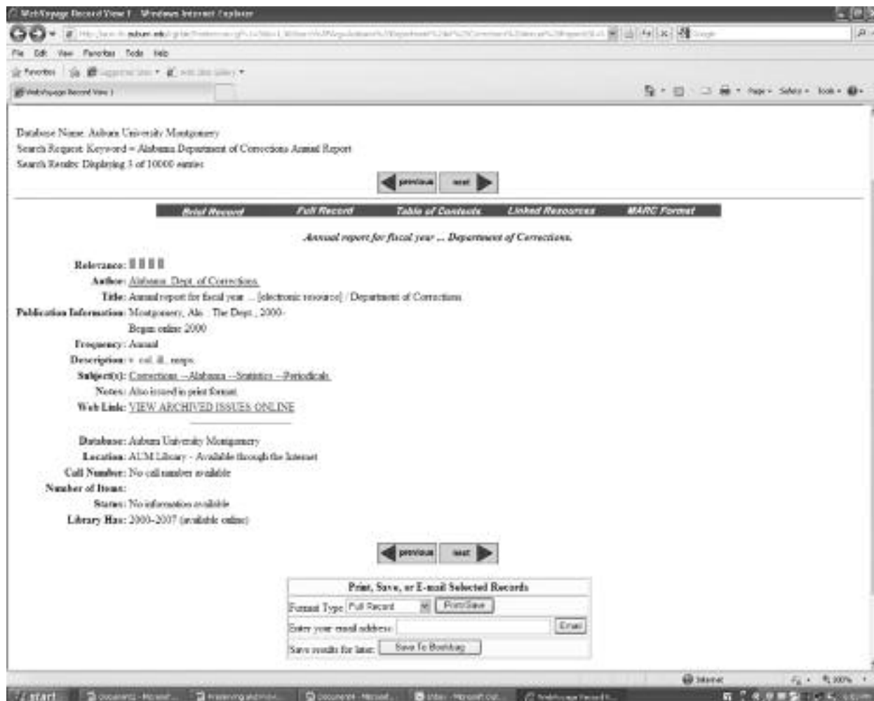
Image 1 AUM OPAC Record for Alabama Department of Corrections Annual Report