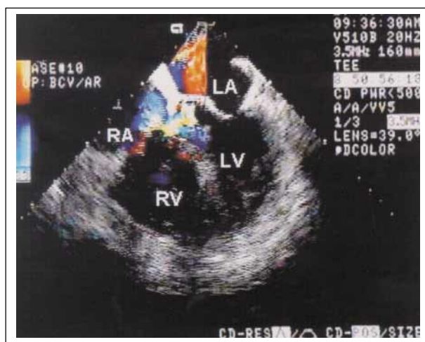
Figure 1. Transoesophageal echocardiography demonstrates dilated right atrium (RA) and right ventricle (RV) and a high velocity shunt from aorta to right atrium. LA = left atrium, LV = left ventricle

aneurysm. His cardiac examination was remarkable for sinus tachycardia and presence of a 3/6 continuous murmur, louder during systole at the left sternal border. The patient underwent transoesophageal echocardiography, which revealed ruptured right sinus of Valsalva, dilated right-sided cardiac chambers, and bicuspid aortic valve (Fig. 1). Color flow mapping revealed evidence of a high velocity shunt from aorta to right atrium. Aortography and cardiac catheterization were performed which demonstrated presence of a fistula from aorta to the right atrium with left to right shunt (Fig. 2). The coronary arteries were free of obstruction, and aortic valve was competent. Mean right atrial pressure was 25 mmHg, right ventricular pressure 65/15 mmHg, pulmonary arterial pressure 64/35 mmHg, and mean pulmonary capillary wedge pressure 30 mmHg. The oxygen saturation in superior vena cava was 55 % and that in right atrium 77 % with a step-up of 22 %. The pulmonary to systemic circulation ratio (qP/qS)