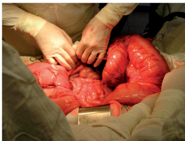
Fig. 2. Distended sigmoid and transverse colon.