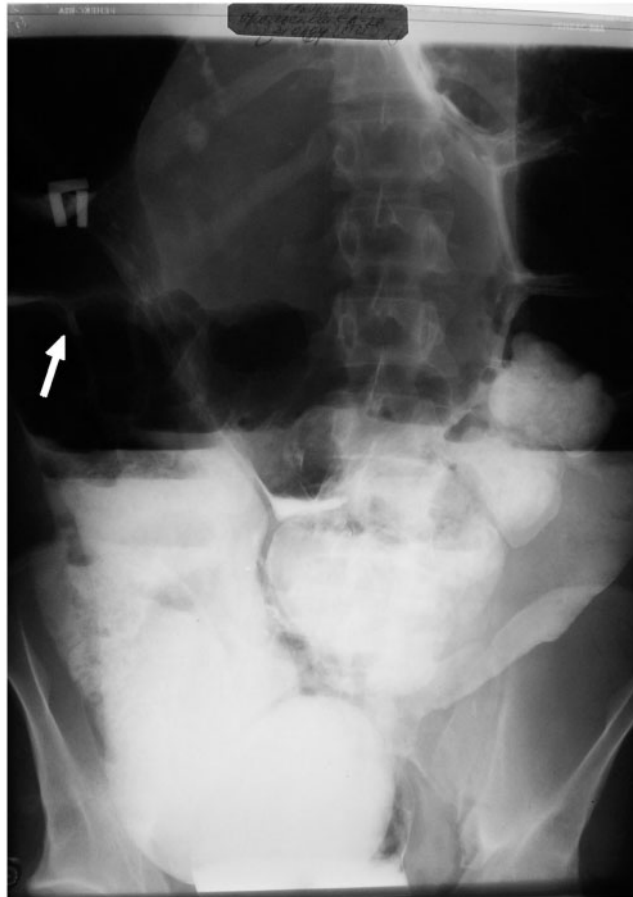
Fig. 1. Upright abdominal radiograph. Dilated and distended bowel loop located beneath the right hemidiaphragm. Chilaiditi sign.

childhood. During his medical history, 3 episodes of emergency hospital admission occurred, in which the patient experienced severe abdominal pain. The condition of the patient worsened over time; pains and bloating became more evident and weight loss over the previous 3 years had been 30 kg.