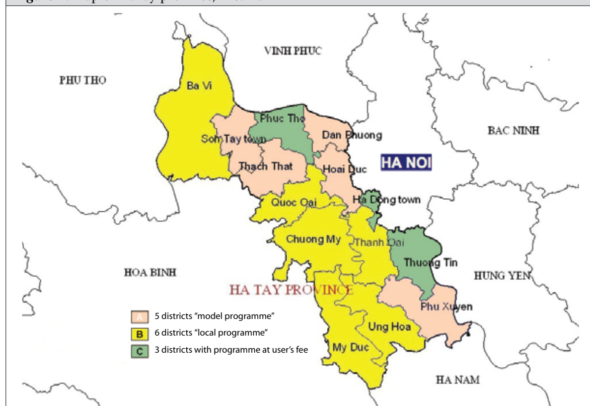
Figure 1. Map of HaTay province, Viet Nam

A 'door-to-door' household survey was conducted in the Group A districts to record all children born after November 1994 as well as to ascertain their JE vaccination history by checking the pre-existing immunization log books at the community health centres and/or immunization card at homes. Those who had no documented previous JE vaccination were identified as eligible for JE immu-