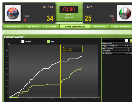
Snapshot 7: Serbia-Italy Score Development Chart [Score: 30-11].

Group 4, assigned to the September 21 game between Serbia and Italy, also seemed to have focused more on the algebra connections. Having analyzed Snapshot 7, S16 interpreted the vertical line as indicating “the score at a specific time.” S17 interpreted Snapshot 8 as follows: “the lines never intersect which means that Serbia was always in the lead from the beginning to the end of the game.” S18 interpreted the dashed vertical line segment in Snapshot 8 as “the score difference at a specific time.”