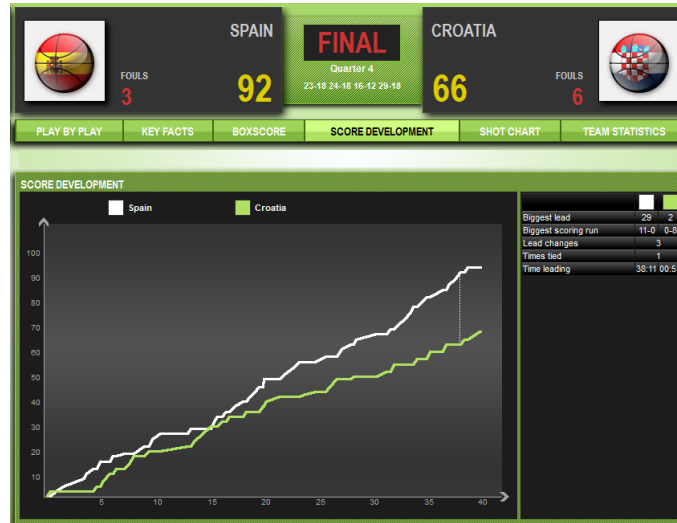
Snapshot 5: Spain-Croatia Score Development Chart [Final].

different bar graphs to display team stats. They compare and contrast things like how many fast break points a team had or how many points from turnover each team had.”