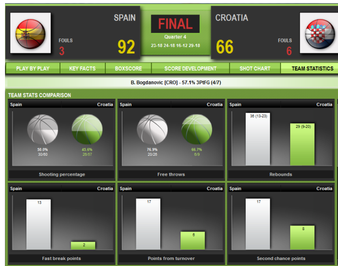
Snapshot 6: Spain-Croatia Team Stats Comparison.