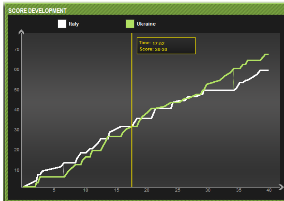
Snapshot 2: Italy-Ukraine Score Development Chart [Score: 30-30].

S4’s analysis based on Snapshots 2 and 3 were more detailed and included more mathematical connections: “point difference in line graphs shows the distance in the scoring of both teams as a specific time in the graph.” Finally, S5 pointed to the fact that the intersecting lines would refer to a draw situation [Snapshot 2]; and that the long white horizontal line segment [Segment 3] would indicate that Italy failed to score for about five minutes: “Italy stayed at a constant point of 48 points while Ukraine kept increasing further into 35 minutes.”