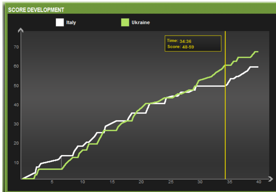
Snapshot 3: Italy-Ukraine Score Development Chart [Score: 48-59].

The students of Group 2 seemed to focus more on probabilistic, rather than algebraic, aspects of the game they were assigned to: the Lithuania-Croatia game on September 20, 2013 [Snapshot 4]. S6, for instance, stated that “Lithuania don’t have a good shooting percentage... they are shooting 27 of 64, which is less than half.” S7 said “if you weren’t to look at the score, you would have assumed Croatia won.” S8 compared the two teams’ 3-point scoring: “Lithuania had a better shooting percentage at the 3-point line.” S9’s analysis was based on the teams’ score development in each quarter: “Both teams had 2 quarters with higher points: Lithuania led Quarter 1 (24-19) and Quarter 3 (21-8) while Croatia led Quarter 2 (18-16) and Quarter 4 (17-16).” Finally, S10 came up with a very interesting and original statistical analysis, which depended on the following point: “Croatia has more fouls which could have contributed to Lithuania’s win since they had more opportunities for shooting fouls.”