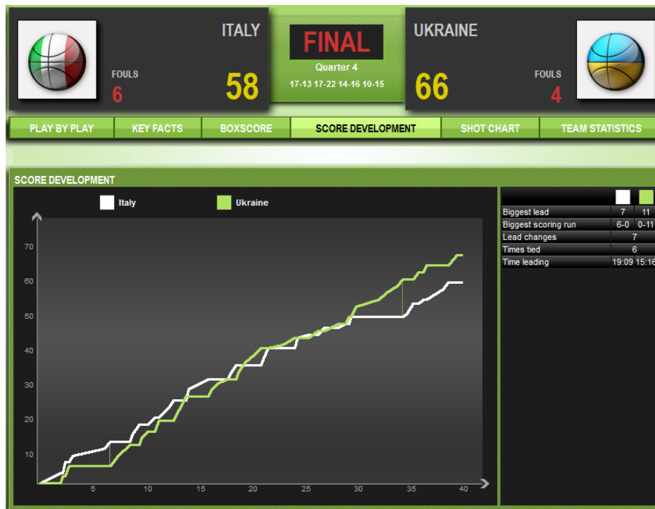
Snapshot 1: Italy-Ukraine Score Development Chart [Final].

The students of Group 1 discussed six snapshots from the Italy-Ukraine game in details and came up with very creative and original mathematical ideas that could be connected to this basketball game. This group seemed to have focused more on the algebra connections.