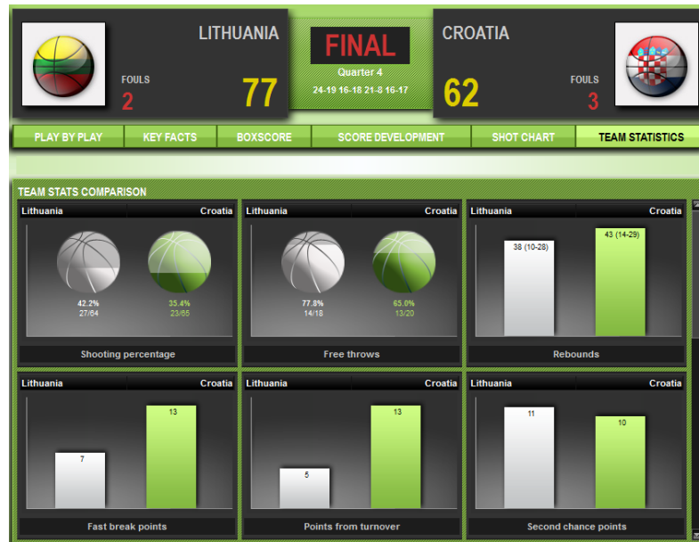
Snapshot 4: Lithuania-Croatia Team Stats Comparison.

Group 3 was assigned the September 22 game between Spain and Croatia. While Group 1 students seemed to focus more on the algebra aspects, and Group 2 students focused more on the statistical aspects, Group 3 students appeared to have focused on both aspects in an equal manner. S11, for instance, emphasized the x and y-axes: “the snapshot [Snapshot 5] uses x and y variables when graphing the linear graph, while the linear graph itself shows the time compared to the score during the course of the game.” S12 stated: “there is a certain time both teams were in the lead and ended up tying for the first time shown on the graph.” One student, S13, in this group, emphasized the color-coded feature of the score development chart: “on the score development graph, the white line shows Spain’s team progress, while the green line shows the Croatia team’s progress.”