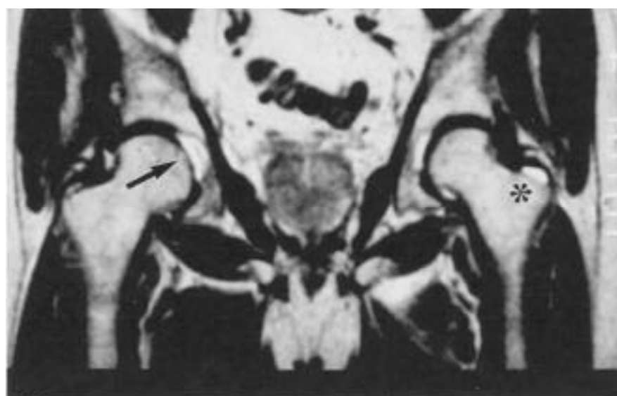
Fig. 2. Hip MRI of a patient with PMR. Axial T2-weighted scan shows bilateral trochanteric bursitis (asterisk) and right hip synovitis (arrow).

trols. Hip synovitis was observed in 17/20 (85%) PMR patients. This finding was more frequently unilateral and its frequency was not significantly different compared to controls. Other hip bursae, such as iliopsoas and ischiogluteal bursae, were involved in 30%