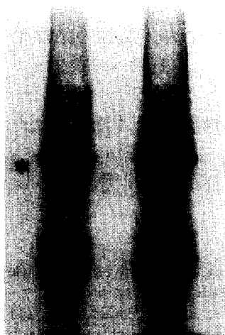
Fig. 1. SDS-PAGE analysis of Giardia cytoskeletal preparation. Giardia cells were extracted with 0.5% Triton X-100 and the insoluble residue was subjected to SDS-PAGE using a 10% gel. Note the strong tubulin band marked by a star and the lower molecular weight giardins.

monomer and synthetic peptides. Automated Edman degradation used instruments with online phenylthiohydantoin amino acid analysis.