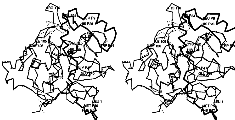
Fig. 1. CA plot of human procathepsin B structure superimposed on the human cathepsin B structure [13]. The proenzyme fold is shown by continuous lines: the propeptide chain is indicated by the bold line, the mature enzyme domains by thin lines and the active-site residues Cys-29 and His-199 are marked and their side chains are shown by bold lines. Proenzyme residues mentioned in the text are marked. The human cathepsin B structure is presented using broken lines.

Interactions between the propeptide chain and the mature