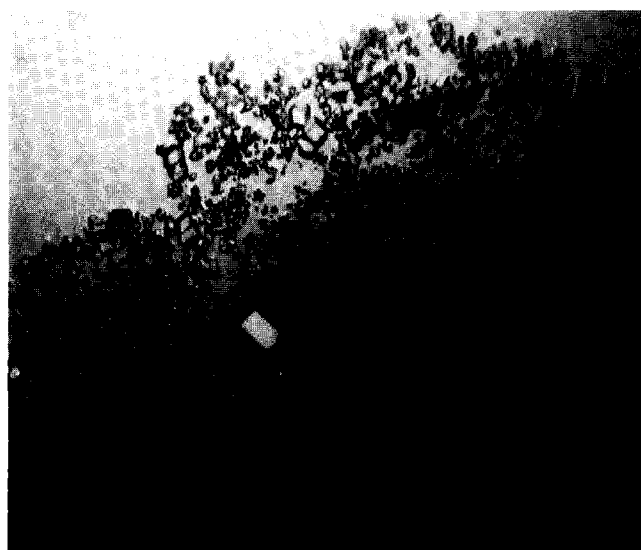
Fig. 2. Crystals of vanadium-dependent haloperoxidase from Corallina officinalis , grown from PEG 6,000. Crystal dimensions were typically 0.3 × 0.3 × 0.3 mm.