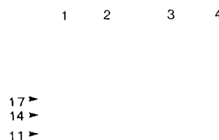
Fig. 1. Recombinant expression of uteroglobin. MDCK or Caco-2 cells, transfected and non transfected, were grown on filters and pulse-labelled with [ 35 S]methionine for 30 min followed by a 5 h chase. The media were collected and immunoprecipitated and analyzed by SDS-PAGE. Transfected MDCK cells (lane 1), non-transfected MDCK cells (lane 2), transfected Caco-2 cells (lane 3) and non-transfected Caco-2 cells (lane 4) are shown. The positions of marker proteins and their molecular masses in kDa are indicated.

In Caco-2 cells recombinant expressed non-sorted proteins are secreted exclusively [25] or predominantly to the basolateral side [26]. The present result thus indicates that also Caco-2 cells secrete uteroglobin in a signal-independent way. It was recently shown that the urokinase-type plasminogen activator is secreted mainly at the apical membrane of MDCK cells but preferentially at the basolateral membrane of Caco-2 cells [3]. In addition Caco-2 cells release all of their endogenous secretory proteins preferentially to the basolateral side [25]. One possible interpretation of these observations is that Caco-2 cells are devoid of an apical pathway for secretory proteins, and consequently uteroglobin as well is secreted to the basolateral side. In contrast MDCK cells are able to specifically target secretory proteins to the apical side [1-3].