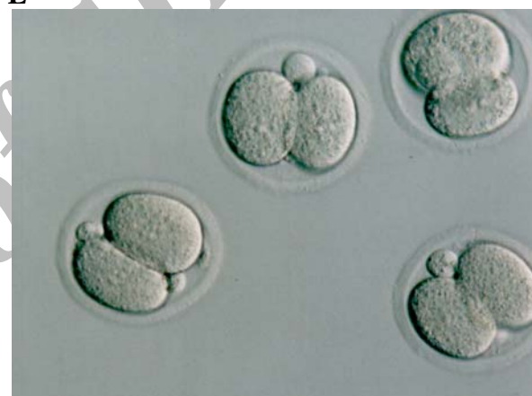
Figure 3D&E. Completion of the second meiotic division (MII) after 24h culture. (D). A fertilized 2-pronuclear zygote (E). A cleaved embryo at 24h post fertilization. All pictures taken under Hoffman contrast optics. Original magnification: \times 320 ; B \times 200 . Bar=32 \mu m.