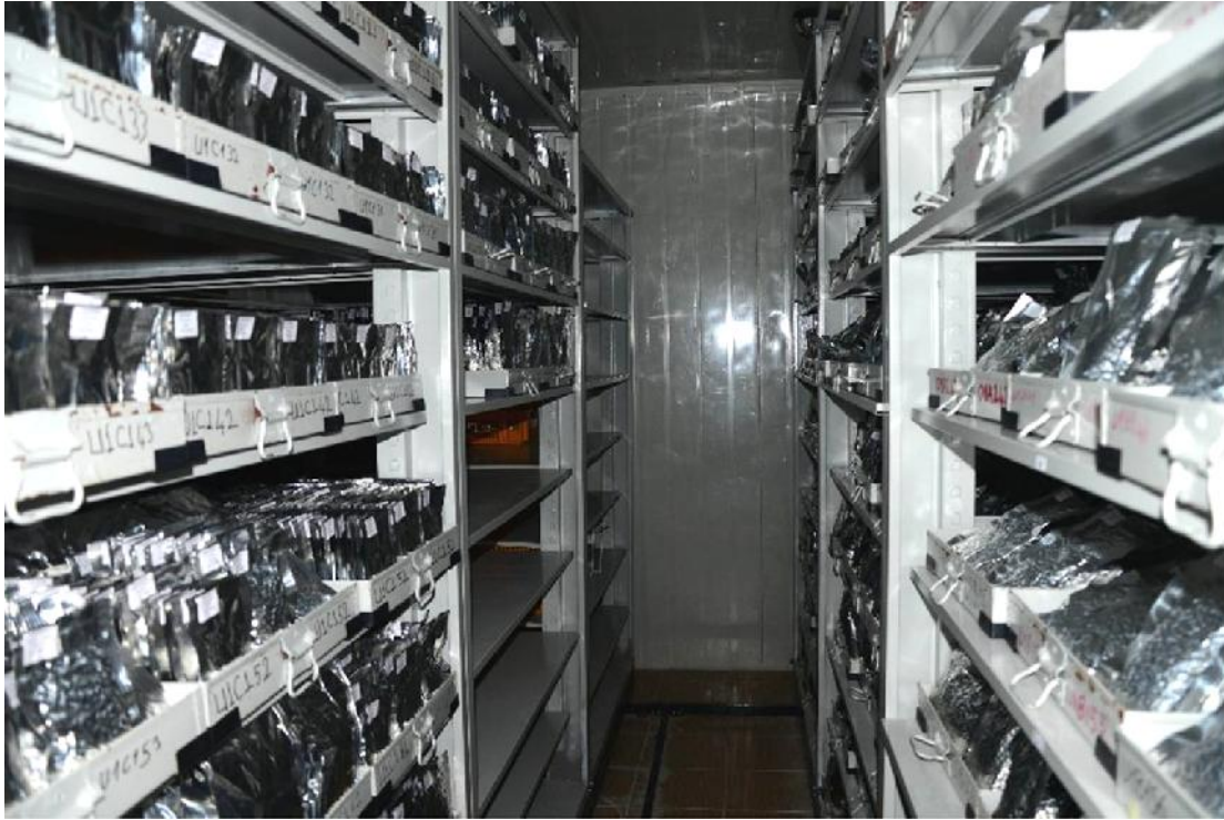
Figure 3. An overview of Turkish Seed Bank conservation room. (Permission obtained from Dr. Kursad Ozbek)