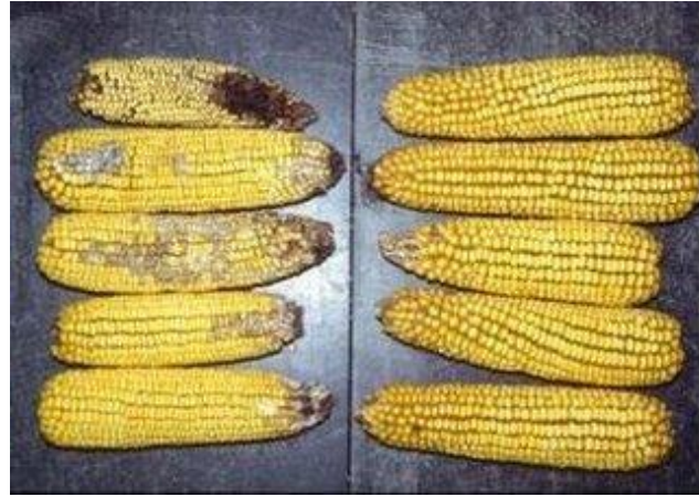
Figure 2. An overview of non-Bt maize (left) and Bt maize (right) after fungal infection (Source: Munkvold and Hellmich 2000, permission obtained from Plant Health Progress).

Avena has three different ploidy levels in the form of diploid, tetraploid and hexaploid like wheat (Loskutov, 2007). As it was listed in other wild crops, wild oat relatives are important for improving biotic and abiotic stress tolerant cultivated oat improvement (Zeller et al., 1998). Portyanko et al. (2001) reported conserved genome regions that were closely synthetic between hexaploid and diploid oat genomes. Cultivated hexaploid forms include Avena sativa and Avena byzantina , while Avena abyssinica identified as tetraploid and Avena strigosa found as diploid. Avena species are distributed mostly in the northern hemisphere and mainly around the Mediterranean Sea and the Canary Islands. Also, there are some endemic species like A. canariensis in the Canary Islands and A. ventricosa found in Cyprus. Different taxonomical classifications have been made according to the settlement and morphological characteristics (Legget and Thomas, 1995) and molecular markers (Wu et al., 2012). Due to the complex relationship between genetic and ecological factors, oat species showed a variation according to their geographical origin (Rezai and Frey, 1988). On the contrary, Runzhi et al., (2007) concluded that genetic diversity of wild oat in the broad spatial scale is not substantially changed by environment, agronomic practices or herbicide usage.