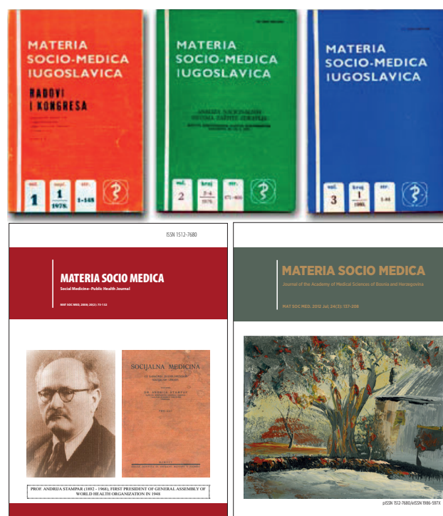
Figure 1. Cover pages of published journal from different periods

The journal in over ten years of its existence, has published more than 1000 scientific and professional papers, by very eminent experts in the field of Social medicine and health care organizations, most of which were presented at three conferences of Social medicine and health care organizations, including: Sarajevo in 1978, Belgrade in 1982 and Zagreb in 1988, and the annual meetings of Social Medicine, which have traditionally been organized on mountain Igman called „Igman Midterms of Social Medicine“ where was presented an average of 50 to 100 reports of experts in Social Medicine from the former Yugoslavia. Also, a few issues