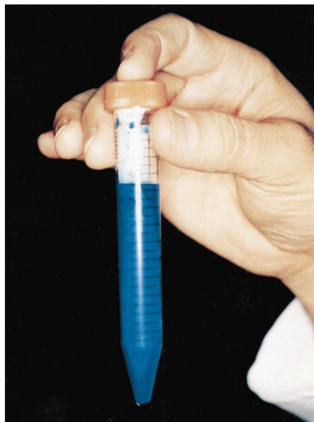
FIGURE 1. Blue-biotin-liposomes. Liposomes remained intense blue color even after three centrifugation washes before resuspension.

Figure 2 depicts anterior 1-min static images showing the greatly increased deposition of ^{99m}\text{Tc} -blue-biotin-liposomes in the left popliteal node (right side of images) that received