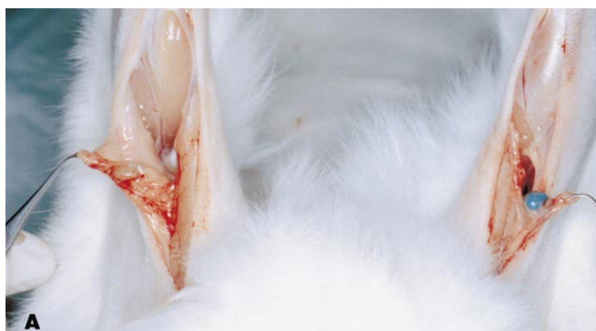
FIGURE 3. (A) Posterior aspect of hind legs of rabbit show exposed popliteal nodes at necropsy at 24 h. Feet of rabbit are located superior to picture. Blue coloration of popliteal node on experimental side (right side of image) that received avidin is readily observed. (B) Excised experimental (right side of image) and control (left side of image) popliteal nodes.

lymph nodes while simultaneously allowing radiotracer localization of the primary lymph node. This lymph node delivery system has several potential advantages over the current sentinel node protocols using both blue dye and radiopharmaceutical colloids: (a) the requirement of only one procedure instead of two separate procedures; (b) definitive verification from scintigraphic imaging that the blue dye has migrated from the injection site to the sentinel node; (c) the potential for decreasing patient time in the operating room because the blue dye localization procedure would not need to be performed just before surgery while the patient is in the operating room; (d) flexibility in the timing of the injection of the agent, which could be performed on the day before the surgery; and (e) the possibility that ^{99m}\text{Tc} -blue-biotin-liposomes will prove to have increased sensitivity for the diagnosis of sentinel lymph nodes.