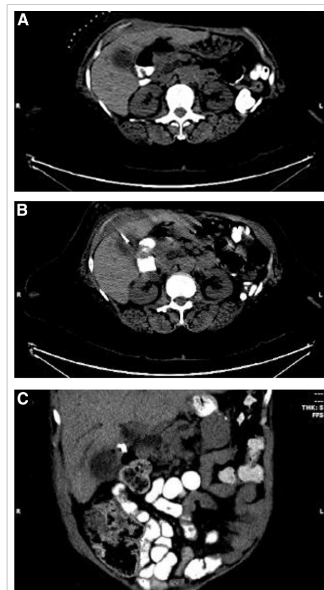
FIGURE 1. Axial (A and B) and reformatted coronal (C) CT images demonstrating abscess in gallbladder fossa with adjacent surgical clips.

heterogeneous, complex fluid collection within the gallbladder fossa that also contained small pockets of air (Fig. 1). The finding was thought to represent either a biloma or an abscess. Hepatobiliary scintigraphy was ordered to rule