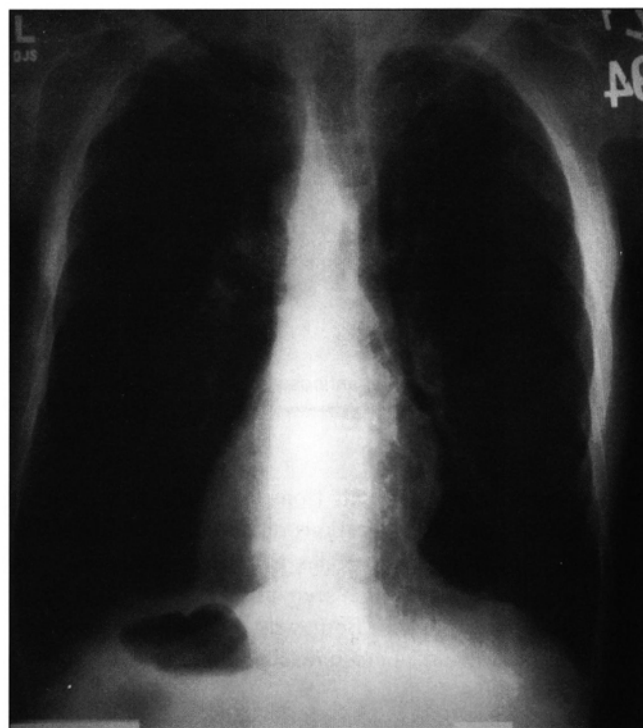
FIGURE 1. Hyperexpansion of the lung fields secondary to chronic obstructive lung disease in a 79-yr-old patient.

Lung Cancer. Lung cancer is primarily a disease of older persons who have smoked cigarettes, and is the leading cause of cancer deaths in men (15). The death rate in women from lung cancer has increased and surpassed that of breast cancer, primarily due to changes in the smoking habits of women. While there appears to be an increased incidence of lung cancer in the elderly, it is unknown whether this increase is due to more cases of lung cancer occurring or to improved awareness and diagnosis of the disease.