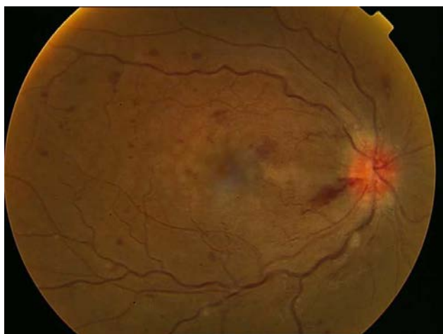
Figure 1: Fundus photograph of the right eye.

A 35-year-old woman presented to our clinic with a one-week history of sudden and painless blurring vision in her right eye. She did not complain of any systemic ailment and her past medical and family history was negative for any specific disease. Corrected visual acuity was 20/80 and 20/20 in her right and left eyes, respectively. Right relative afferent pupillary defect was slightly present. Anterior segment examination was unremarkable in both eyes. Intraocular pressure was 12 mmHg in both eyes. There was a mild anterior vitritis in the right eye. Right eye funduscopy showed retinal hemorrhages, cotton wool spots, and venous engorgement and dilation in all quadrants as well as swollen optic disc (Figure 1). The left fundus was normal. Clinical diagnosis of non-ischemic CRVO presenting as a papillophlebitis in the right eye of the patient was confirmed also by fluorescein angiography (Figure 2 and 3). Another ancillary ophthalmic test was optical coherence tomography which demonstrated no significant macular thickening (Figure 4).