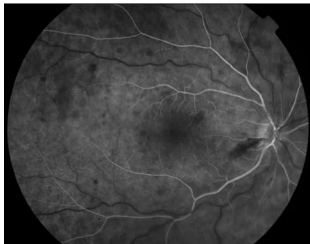
Figure 2: Fluorescein angiography of the right eye, early phase.

Blood investigations including blood cell count, venereal disease research laboratory (VDRL), collagen vascular screen and coagulation profile (hemocystein, antithrombin III activity, and protein C and protein S activity, and IgG anticardiolipin) were normal. The erythrocyte sedimentation rate (ESR) was 11 mm/1st hour. Chest radiography was normal. The Mantoux (or PPD, purified protein derivative) test was positive with 18 mm induration and 2+ redness.