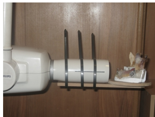
Figure 2. The mandible and the x-ray tube mounted on the holder (lateral view).