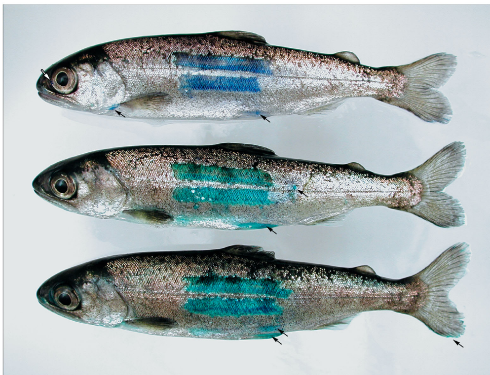
Fig. 1. Oncorhynchus tshawytscha . Appearance of juveniles exposed to trypan blue or fast green FCF immediately following intentional descaling injury. Top: trypan blue (0.05% aqueous solution for 10 min according to the procedure of Kiryu & Wakabayashi 1999); middle: fast green FCF (0.1% aqueous solution for 1 min); and bottom: fast green FCF (0.5% aqueous solution for 1 min). All fish were given two 30 s rinses in fresh water after dye exposure. Arrows mark staining of sites of unintentional integumental injury

the non-descaled group exposed to 0.1% fast green for 2 min (Table 2). Mortality did not exceed 4% in either group. For the groups of fish transferred and held in seawater, mortality was higher, ranging from 13 to 27% (Table 2). Comparison of the non-dye-exposed control groups in the seawater experiment indicated that the occurrence of mortality was independent of whether the fish were descaled or not ( p = 0.6 ). Further comparison of non-descaled groups that were exposed to either no dye or to 0.1% or 0.5% fast green indicated that the occurrence of mortality was independent of the treatment type for both the 1 min ( p = 0.2 ) and 2 min ( p = 0.2 ) exposure groups. The combined effects of dye exposure and descaling on mortality were also investigated. For the descaled groups exposed for 1 min