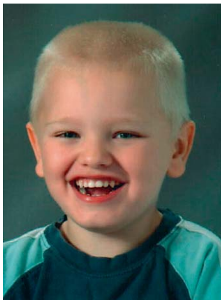
Fig. 2. Facial features of case 16.

2007]. More surprising was that 3 of our distal breakpoints were not flanked by known LCR22s, but all resided in a region of ~20.9–21.0 Mb on chromosome 22q (fig. 1). This could indicate an additional locus that predisposes to NAHR (the proximal breakpoints lie within LCR22s likely excluding a replication-based mechanism).