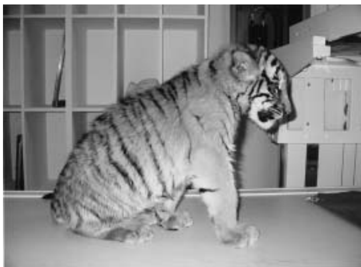
Fig. 1. A three-month-old female Siberian tiger cub shows ataxia and acute bilateral hindlimb paresis.