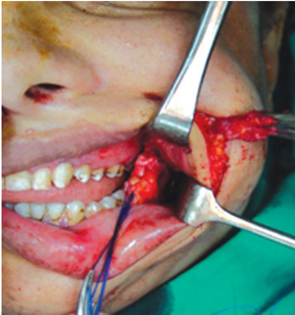
Figure 3 A fascia lata graft sutured to the insertion of the temporalis intraorally and passed through a supra-SMAS tunnel to reach the nasolabial crease.

extended no more superior than the occlusal plane of the mandibular teeth to help prevent herniation of the buccal fat pad into the surgical field. Subperiosteal dissection was done superiorly till the glistening insertion of temporalis at the coronoid was reached. Stripping the insertion of the muscle was done meticulously while holding it with several prolene 3/0 sutures to avoid its cephalad retraction. A 3-cm incision at the nasolabial fold was made where the orbicularis oris muscle was exposed. Wide subcutaneous undermining was performed cephalad creating a tunnel superficial to the superficial musculoaponeurotic system (SMAS), which was then connected to the intraoral incision (Fig. 3). A fascia lata graft, 3 × 10 cm, was harvested and sutured to the insertion of the temporalis. The graft was passed into the subcutaneous tunnel and its caudal end was sutured