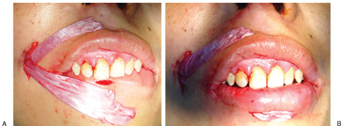
Figure 4 The fascia lata graft was split and each half passed for a few centimeters into a subcutaneous tunnel to the corresponding lip.

The study population included nine female patients and three male patients with old unilateral complete facial paralysis. The average age of patients at the time of reconstruction was 16.4 years (range, 7 to 45 years). The average duration of paralysis was 9.8 years (range, 3 to 21 years). The causes of facial paralysis included four posttraumatic cases, three congenital cases, and three cases of Bell's palsy; in the remaining two cases it occurred following tumor resection. All patients were ruled out for the risk of developing corneal ulcers prior to reanimating the corner of the mouth.