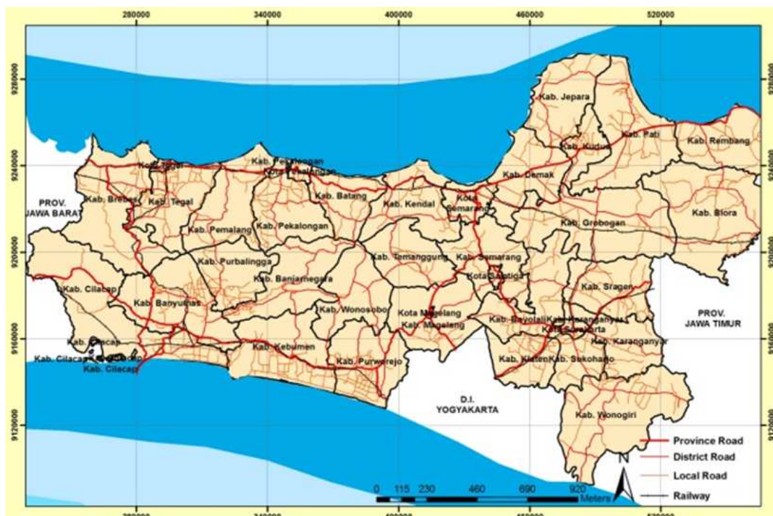
Fig. 1. Map of CENTRAL Java Province, Indonesia

Implementing the RAD-GRK is an additional task for all the stakeholders, including the CJPG. This additional task is of two kinds: (1) New work or program that has never been done before and (2) refinement of the existing work or program.