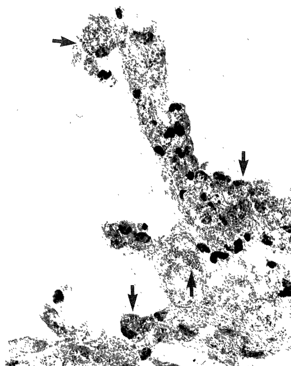
Fig. 3. Numerous Gram-negative small bacilli (arrows) are present in and around macrophages infiltrating into the meninges of the pons. Gram stain. \times 400 .

erosions of the gallbladder as well as a decrease in number of lymphocytes in the lymphatic tissues such as the spleen, thymus, several lymph nodes, and intestinal lymphonodules. Numerous Gram-negative small bacilli were found in and around macrophages infiltrating into the purulent lesions of the whole body by Gram stain (Fig. 3). Unfortunately, no joint was histologically examined.