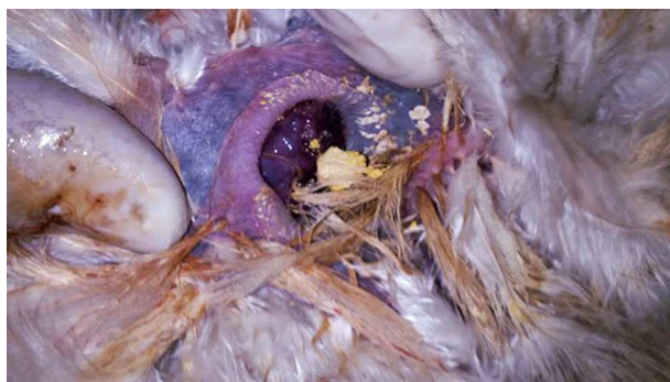
Fig. 2. Prolapse