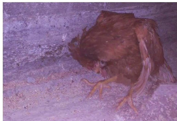
Fig. 6. Torticollis