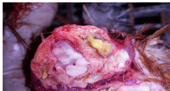
Fig. 5. Purulent inflammation of cranial bones