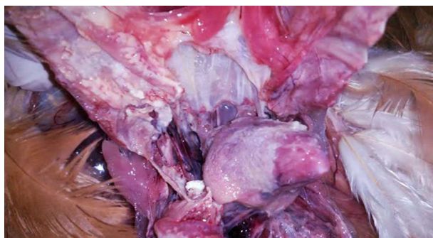
Fig. 4. Pericarditis-Airsacculitis of posterior thoracic air sacs