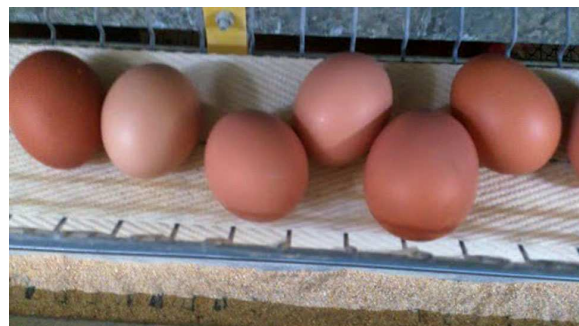
Fig. 7. Discoloration of brown eggs