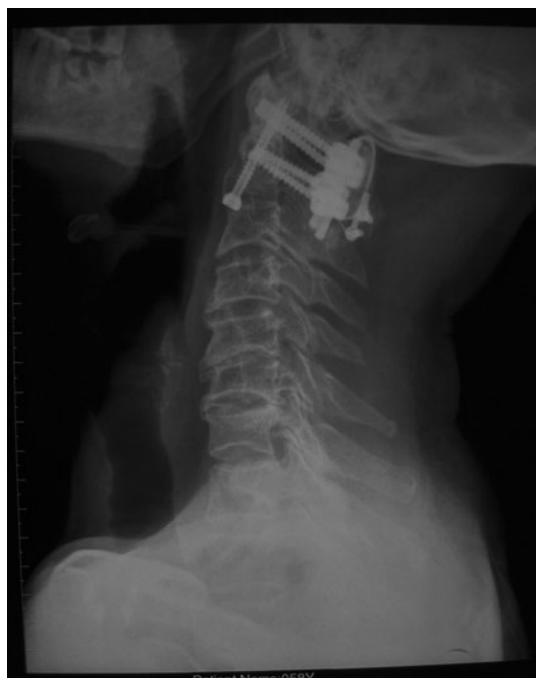
Fig. 5 Lateral cervical film at 12 months after surgery demonstrates a healed fracture and arthrodesis of the C1–C2

related to the procedure. A simple neck collar was used for 3 months. Cervical film at 12 months after surgery demonstrated a healed fracture and arthrodesis of the C1–C2 (Fig. 5).