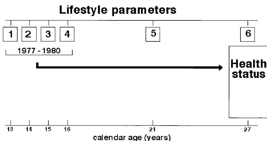
Fig. 1 Relationship between health status measured at adult age (i.e. at the age of 27 years) and lifestyle parameters measured during adolescence (i.e. at age 13–16 years)

the analyses reviewed here the daily intake of the following nutrients was calculated: (1) the intake of saturated fat (SFA), expressed as energy percentage; (2) the intake of poly unsaturated fat (PUFA), expressed as energy percentage; (3) the ratio between the absolute intakes of PUFA and SFA (P:S ratio); (4) the intake of carbohydrates, expressed as energy percentage and; (5) the intake of cholesterol (Chol), expressed in mg/mJ.