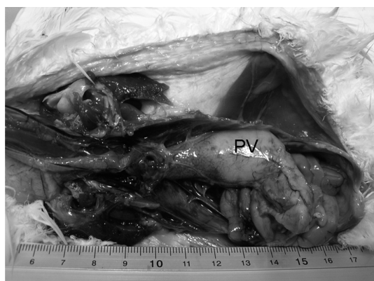
Fig. 1. Distended proventriculus (PV) at necropsy of the Citron-crested cockatoo.