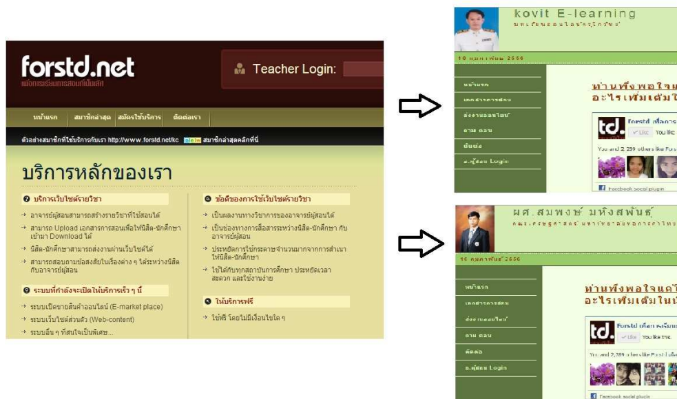
Fig. 2. The outline of the application according to the model