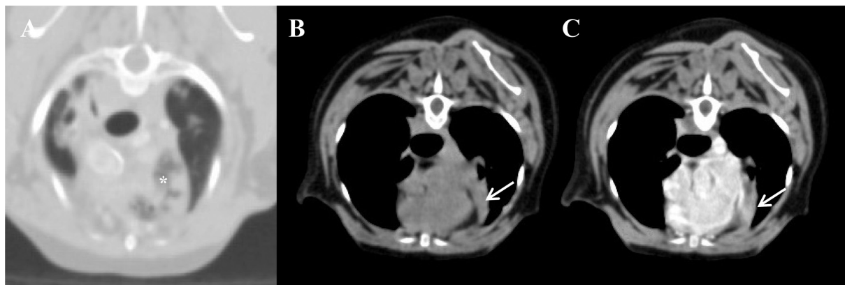
Fig. 3. Axially reformatted image of the lung (A) and mediastinal window (B, C). (A) The twisted lung lobe contained trapped gas (bottom, asterisk). (B, C) After intravenous contrast medium was administered (B, before; C, after), the mean increase in enhancement of the twisted lung lobe (arrow) was similar to the enhancement of focal infiltration in a normal lung lobe.