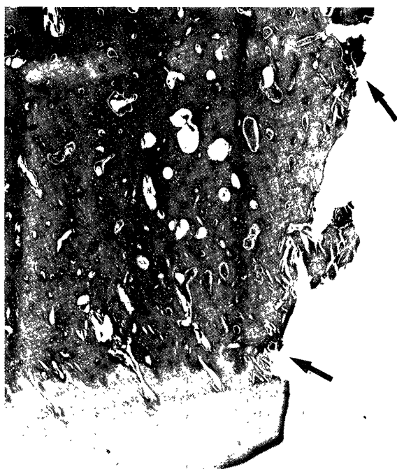
Fig. 3. Area of osteosclerosis with osteonecrosis (arrow) from a 3 year-9-month-old horse with McIII longitudinal fracture during race (7 races). Border of the tissues on the right is fracture line. McIII, HE stain. \times 26 .