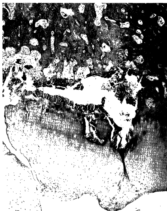
Fig. 4. The thickened articular cartilage shows a fissure, which has resulted in tissue separation. The subchondral bone tissues show destruction (necrosis), and the bone marrow cavities show narrowing and fibrosis (2 year-7-month-old, male, short racing history). McIII, HE stain. \times 105 .

sive exercise [9, 10]. Additional factors may include localized hypoxia and/or ischemia caused by vascular alterations, under the existence of antecedent osteochondrosis. The fibrous scar of the articular cartilage and the surrounding fibrosis of the subchondral necrosis in older horses with longer racing careers indicate reparative changes as compensation for superficial erosions of articular cartilage and osteochondronecrosis. Because the increase in the severity of osteosclerosis appeared related to the number of races run, we suggest that osteosclerosis may be a reactive change for the osteonecrosis and load-bearing stress during progressive exercise. We speculate that the existence of chondrometaplasia and osteonecrosis may have been affected by hypoxia and ischemia due to circular disturbance in long-term.