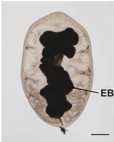
Fig. 2. (Color online) Paragonimus larva isolated from the muscle sample of a wild boar. EB, excretory bladder; Bar = 0.2 mm.

have shown that wild boars from Miyazaki Prefecture are infected with P. westermani larvae in their muscle tissue (4,5). Herein, we demonstrate that P. westermani -positive animals are also prevalent in Kagoshima Prefecture. The two prefectures neighbor each other in the Southern part of Kyushu Island (Fig. 1).