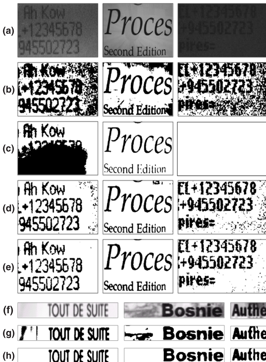
Fig. 3. Binarization results. (a) Original images. (b) Niblack's method. (c) Sauvola's method. (d) Christian's method. (e) Proposed method. (f) Additional images. (g) Christian's method. (h) Proposed method.