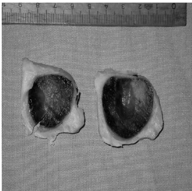
Fig. 1. Macroscopic view of the infarcted fibroadenoma.