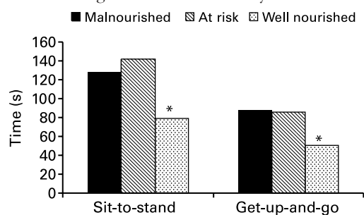
Fig. 1 Measures of lower-body strength according to nutritional risk category as assessed using the new screening tool, where a shorter time indicates better physical function. Significant difference between categories (analysis of variance): *, P < 0.05