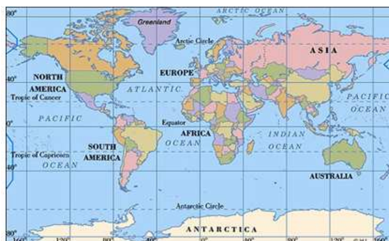
Fig. 2. Regions marked with individual colors for differentiation