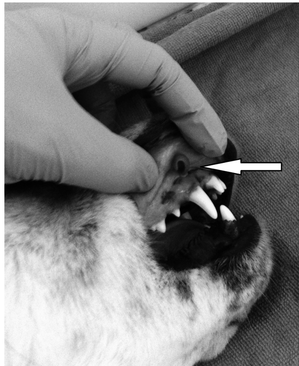
Fig. 1. L. nilotica gum of male stray dog (white arrow).

The extraordinary finding of L. nilotica in a stray dog in Italy suggests that any infestations in wild and domestic mammals, including humans, may be possible. For this reason, during the veterinary examination, Hirudinea ectoparasites should be included in the differential diagnoses for unexplained anemia, oral bleeding and caught in animals which may have been exposed to contaminated water not only in tropical regions but also in all areas where aquatic leeches are commonly found, included Italy. The animals may come in contact with leeches not only by drinking water, but also walking down the infested little rivers. Such route of transmission may also affect humans. Even though such water is not usually used for drinking, children often swim or play there. Therefore, a low but non negligible risk to become