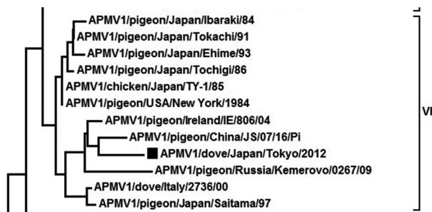
Fig. 8. Higher magnification of a part in Fig. 7. The present strain is most closely related to the Chinese strain "APMV1/pigeon/China/JS/07/16/Pi".