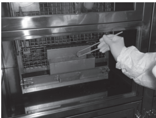
Fig. 1. Oocysts contained pellets were fed to the fasted monkeys.

On Day 44 or 45, all monkeys were euthanized by exsanguination by cutting both the posterior aorta and vena cava under anesthesia, and complete necropsy was done. Organs and tissues, including the liver, pancreas, spleen, kidneys, urinary bladder, adrenal glands, heart, lungs, trachea, thyroid glands, brain, testes, epididymis, prostate, seminal vesicle, esophagus, stomach (fundic and pyloric parts), duodenum, jejunum, ileum, cecum, colon, mesenteric lymph node, sternum (including bone marrow) and femur (including bone marrow) were collected and fixed in 10% neutral buffered formalin. After the fixation, to decalcify the sternum and femur, these tissues were macerated in formalin solution with formic acid. The fixed organs/tissues were routinely processed and embedded in paraffin, and paraffin sections were stained with hematoxylin and eosin and examined microscopically.